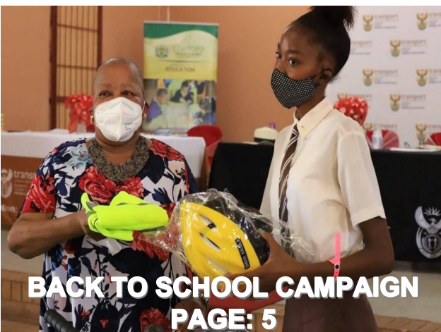
BACK TO SCHOOL CAMPAIGN PAGE: 5