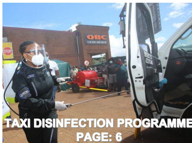
TAXI DISINFECTION PROGRAMME PAGE: 6