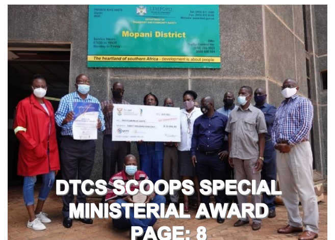
DTCS SCOOPS SPECIAL MINISTERIAL AWARD PAGE: 8