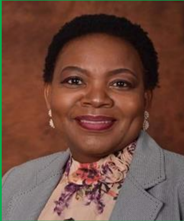
MEC MAVHUNGU LERULE-RAMAKHANYA

Let me take this opportunity to welcome each one of you back at work in this first edition after a very busy festive season. It is unfortunate that we resume at the time when the country is placed in an adjusted lockdown level 3. The resurgence of the virus and the new variant has forced us to resort back to rotational working arrangement. It is not an ideal arrangement but under the current wave of COVID19, it is vital that we follow health protocols and reduce the spread of the virus. It is sad that we have started the year without some of our colleagues who have either succumbed to the deadly virus or died due to other causes. The lockdown restrictions prevented us from attending their funerals or to support their families during the mourning period at the time when they needed us most.