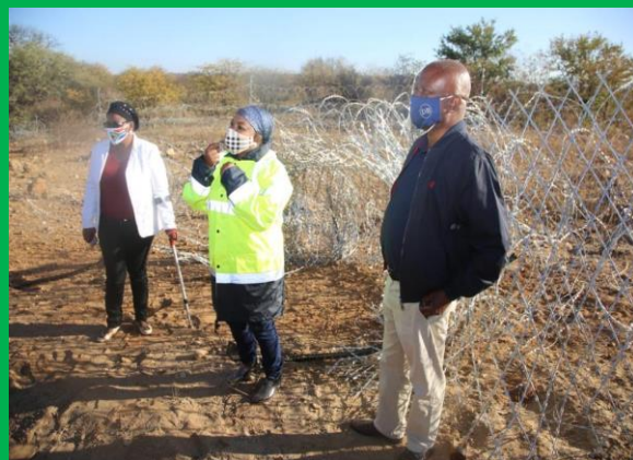
COVID-19 OPERATION AT BEITBRIDGE P. 10