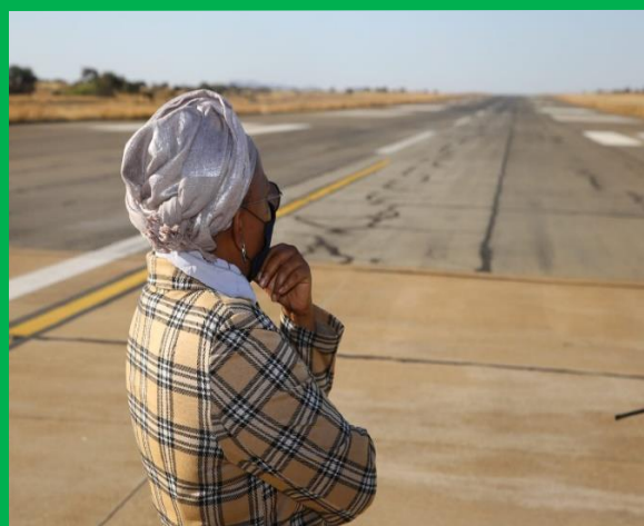
MEC ON AN OVERSIGHT VISIT AT GAAL P. 7